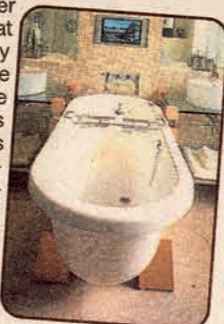
The bathrooms have LCD TVs