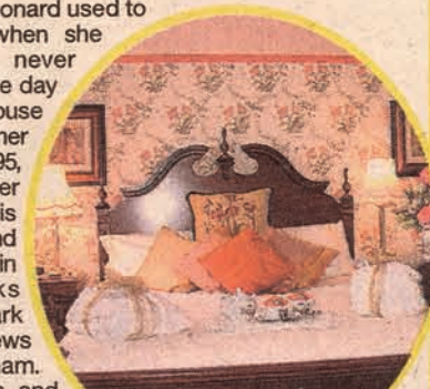
Decor is rich and colourful

LANDLADY Gill Leonard used to visit Moorlands when she was a little girl, never dreaming she'd one day own and run the house as a B&B. The former vicarage, built in 1895, scooped the other Silver Prize in this year's Enjoy England awards. It lies within the North Yorks Moors National Park with sweeping views across to Levisham. The decor is rich and colourful with all of the seven rooms individually designed. Portions at breakfast and dinner are generous to fuel brisk walks across the moors and along the coast. HOW MUCH? B&B costs £60pp per night and dinner, bed and breakfast costs £85pp per night. Go to www.moorlandslevisham.co.uk or call 01751 460229.