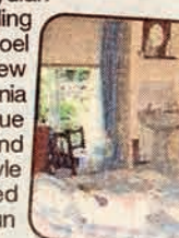
Rooms have period style

STRETCH your legs along Offa's Dyke long-distance footpath when you take a spring break to Bryn Tirion. The five-star award-winning B&B – fringed by cottage gardens and meadows – is in the Clwydian Hills, designated an Area of Outstanding Natural Beauty. The Loggerheads and Moel Famau Country Parks are just a few minutes from the front door and Snowdonia is about 45 minutes drive away. Antique furnishings, claw-footed bathtubs and Laura Ashley bed linens show period style never loses its shine. Breakfast is served in the conservatory and there's a sun lounge for late afternoon snoozes. HOW MUCH? B&B starts from £30pp per night when two share and from £40 per night single. Bryn Tirion also has a self-catering apartment from £270 per week. Go to www.bryn-tirion.com or call 01352 810 444.