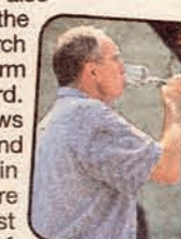
Sip wine from the vineyard

WINE tasting is all part of the fun when you check into Llanerch Vineyard, an award-winning B&B in South Wales. Guests are encouraged to follow trails through the vines and beyond to woodland and lakes. It's also a telly star, having been featured on the BBC's Holidays Out programme. Llanerch Vineyard is carved out of 19th Century farm buildings that look across the vineyard. The B&B rooms are in the Andrews family's Glamorganshire farmhouse and there are self-contained studios in converted winery buildings. The 20-acre estate is in the Vale of Glamorgan yet just a quarter hour's drive from the centre of Cardiff for nights out and shopping expeditions. HOW MUCH? B&B costs from £49 for single occupancy and £69 for two people sharing per night. Call 01443 225877 or go to www.llanerch-vineyard.co.uk