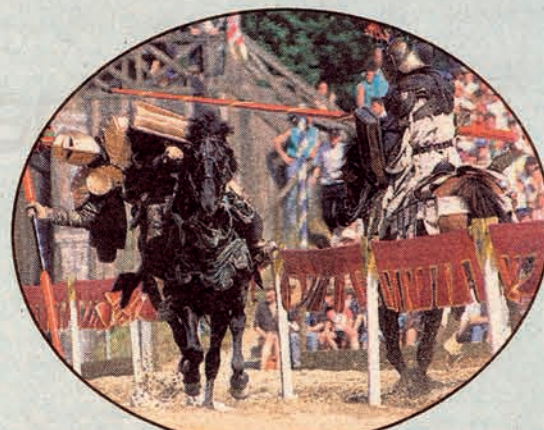
See knights fight it out at Cressing Temple, Essex