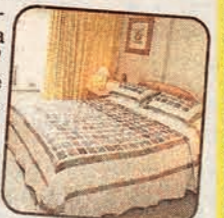
One of the rooms

GUESTS checking into the new rooms at The Old School might be a little prickly. That's because these special guest rooms on the edge of the woods are designed for poorly hedgehogs being nursed back to health by wildlife groups. Their accommodation, say the owners, "will be on a bed and breakfast basis, of course." The Old School near Newton on the Moor has just scooped a Silver in the Enjoy England awards, and has also received a Green Tourism award. The 18th Century stone property is surrounded by woodland for walks. You're five miles south of Alnwick for trips to the castle and The Alnwick Garden and to the west you have the Northumberland National Park.